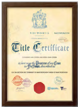
Certificate of Title