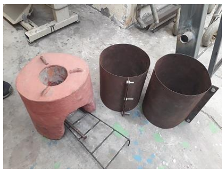
Fuel efficient safety stoves

The Uma Ita Nian Clinic's community-based rehabilitation and nutrition program in remote villages, this year included the St Francis Assisi Disability Workshop, manufacturing small fuel efficient earthen stoves to improve safety where a household member lives with a disability.