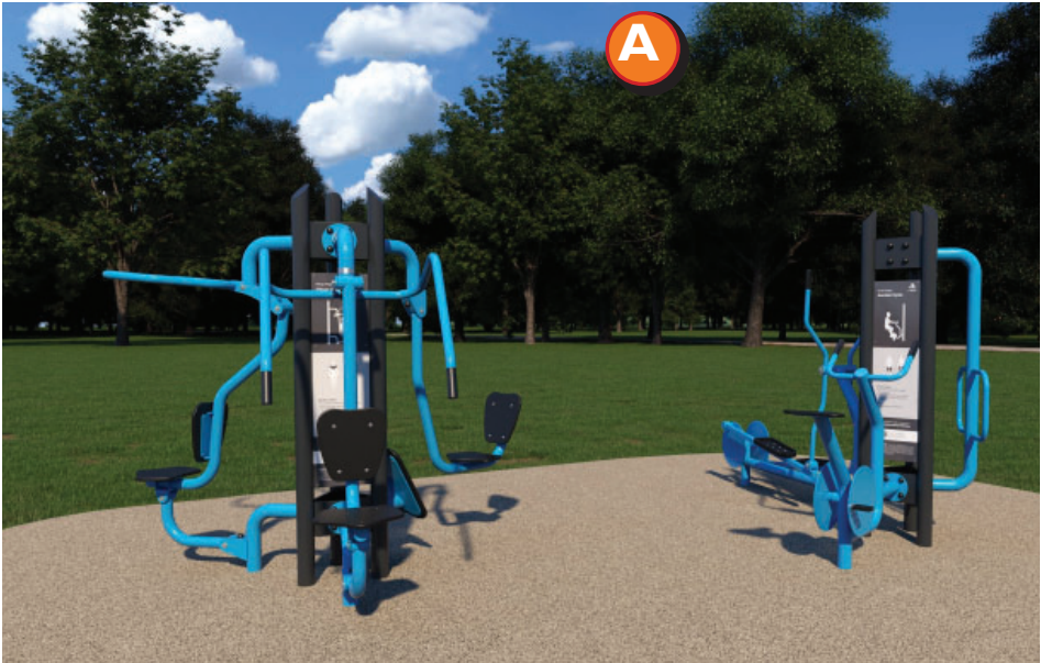
Aerobic and cardio fitness equipment station