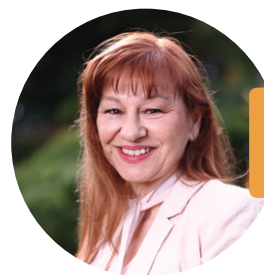
HARMONY PARK WARD

I am a lifelong Glenroy resident and independent Councillor, committed to acting with integrity and being a strong voice for Merri-bek. My priorities include revitalising local shopping strips, supporting small businesses, improving infrastructure, enhancing aged and children's services, and upgrading sporting facilities, all aimed at strengthening and connecting our community.