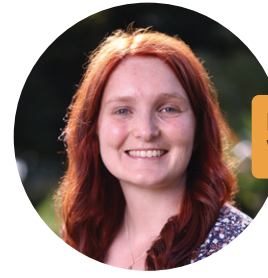
BRUNSWICK WEST WARD

I am a tradesman painter who proudly calls Glenroy home. As someone with a learning disability, I'm dedicated to empowering the community and advocating for better services and support for people with disability and mental health challenges. I am committed to give back to the community that has supported me.