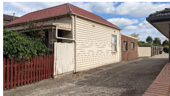
Fig. 2: Subject site eastern elevation as viewed from shared laneway with 6 Arnold Street (taken by planning officer 24/11/2020)