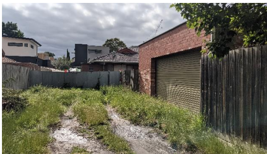
Fig. 3: Rear of subject site looking east