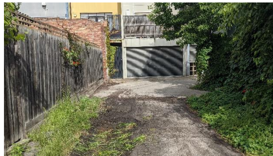
Fig. 4: Rear of subject site looking west (taken by planning officer 24/11/2020)

A location and zoning plan form Attachment 1 and Attachment 2 respectively.