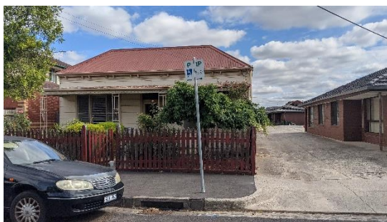
Fig. 1: Subject site as viewed from Arnold Street

Immediately adjoining the site to the east and west are unit and townhouse developments. Opposite (south) are detached single storey dwellings, and to the north is the rear unconstructed laneway. North of the laneway are unit developments and rear yards of dwellings facing Glenlyon Road.