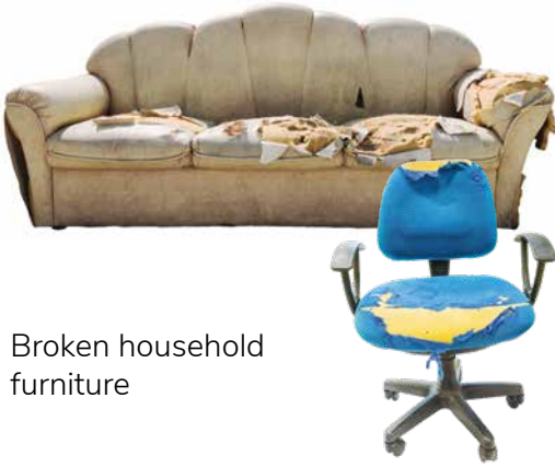
Broken household furniture