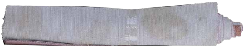
Carpet rolled and tied. One roll only, up to 1.5 metres in length and light enough for 2 people to lift.