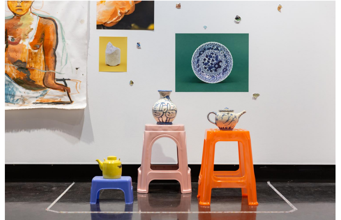
of Peonies, Still Life and a Duck, 2023