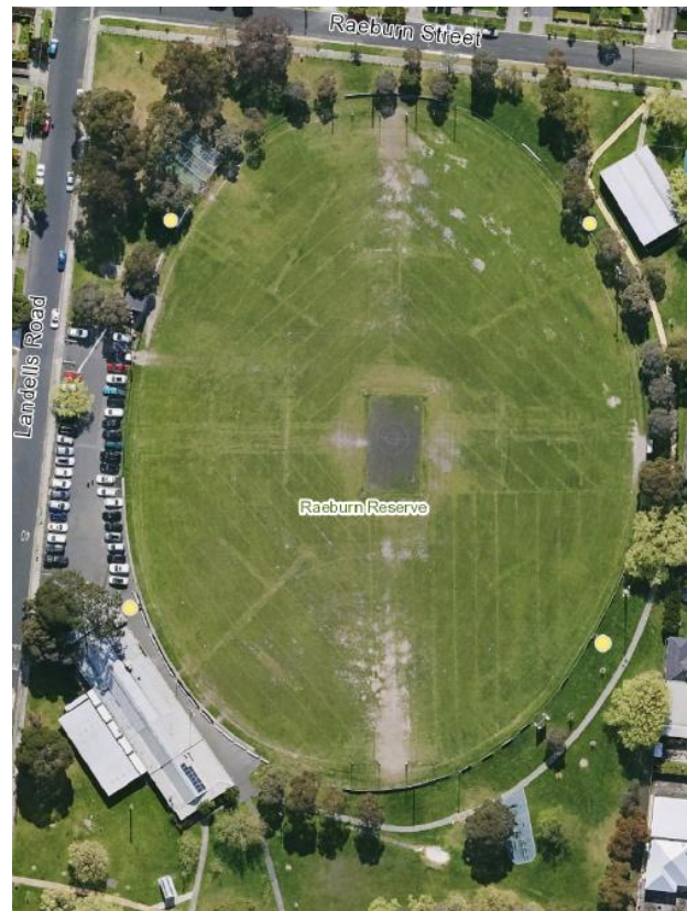
Image: Location of proposed poles in yellow.