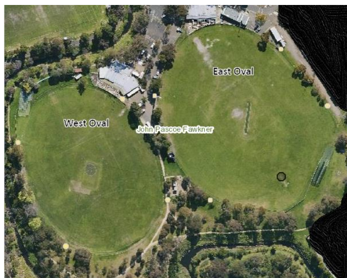
Image: Location of proposed poles in yellow.