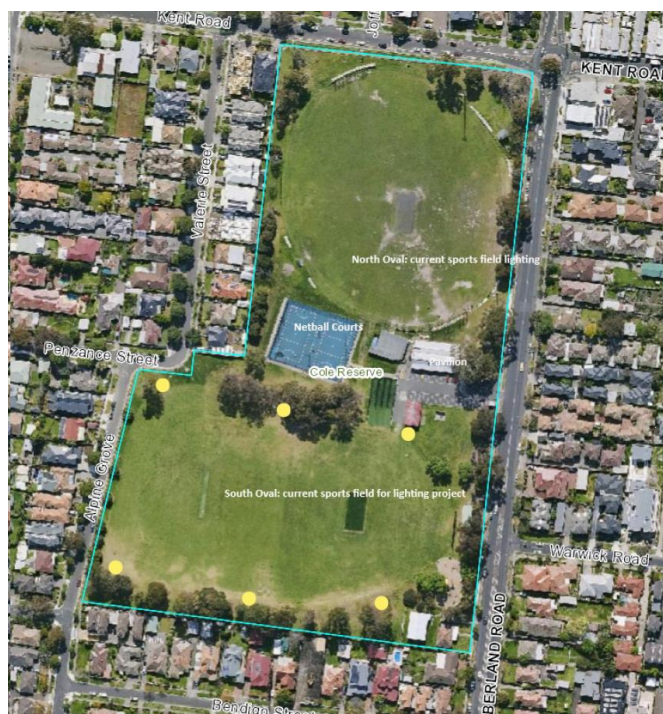
Image: Location of proposed poles in yellow.