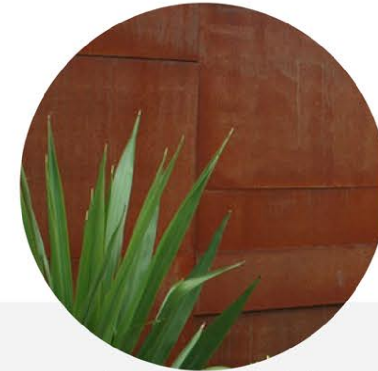
corten steel backdrop