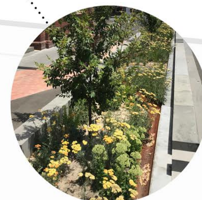
planting (subject to underground services)