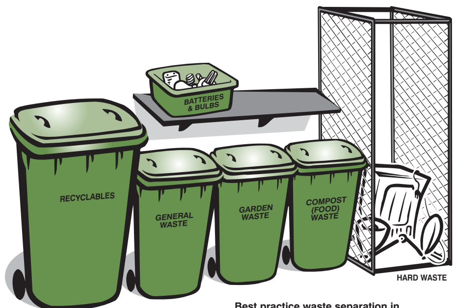
Best practice waste separation in multi-unit residential developments.

Construction sites can represent a great burden on local waterways. Site litter, paint, solvents, bricks, cleaning substances and clean-fill can all contaminate stormwater runoff. It is an offence under the Environment Protection Act to discharge contaminated water into the stormwater system. To avoid contamination, ensure that a drainage system is installed before construction activities commence and storm water is diverted from areas where soil is exposed.