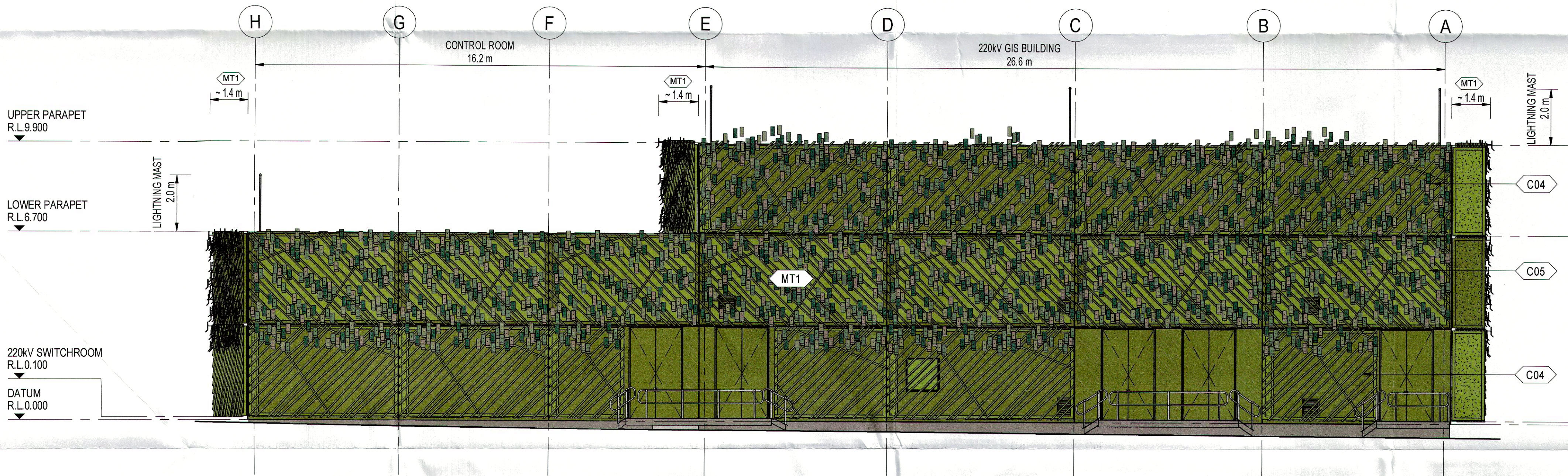
2 EAST ELEVATION 1:100