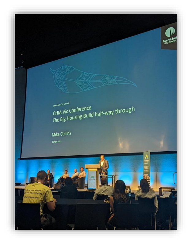
Presenting to the Community Housing Industry Conference in April

After an extensive program of consultation with Victorian councils in 2022, a draft Social and Affordable Housing Compact was supported by the Municipal Association of Victoria. However, the local government sector is awaiting state government sign-off. Officers contributed to a co-design process for local area agreements with Homes Victoria. Progress has been confirmed on $210m of investment in new social housing by the state government with 89 homes delivered and a further 483 underway.