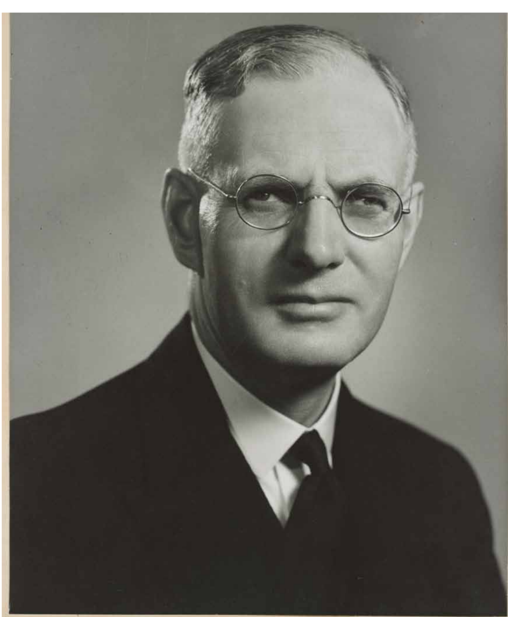
JOHN CURTIN Labor Prime Minister of Australia 28 October 1941 to 30 July 1945 Oval 363 July 1945

Conscription was fiercely debated in the Moreland area.